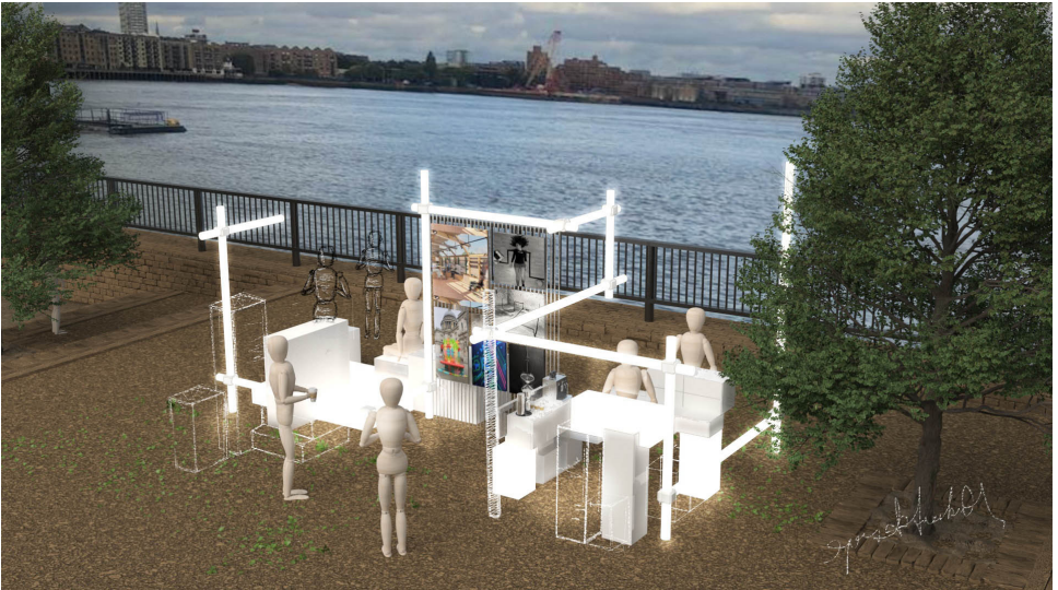
The spatial intervention is derived from body extensions, experiments, and prototypes.