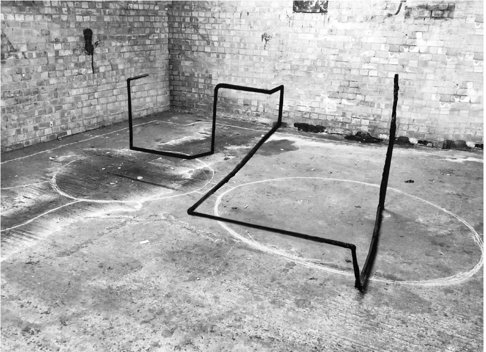
The first prototype of the Association Device, featured on the cover page of the catalogue.